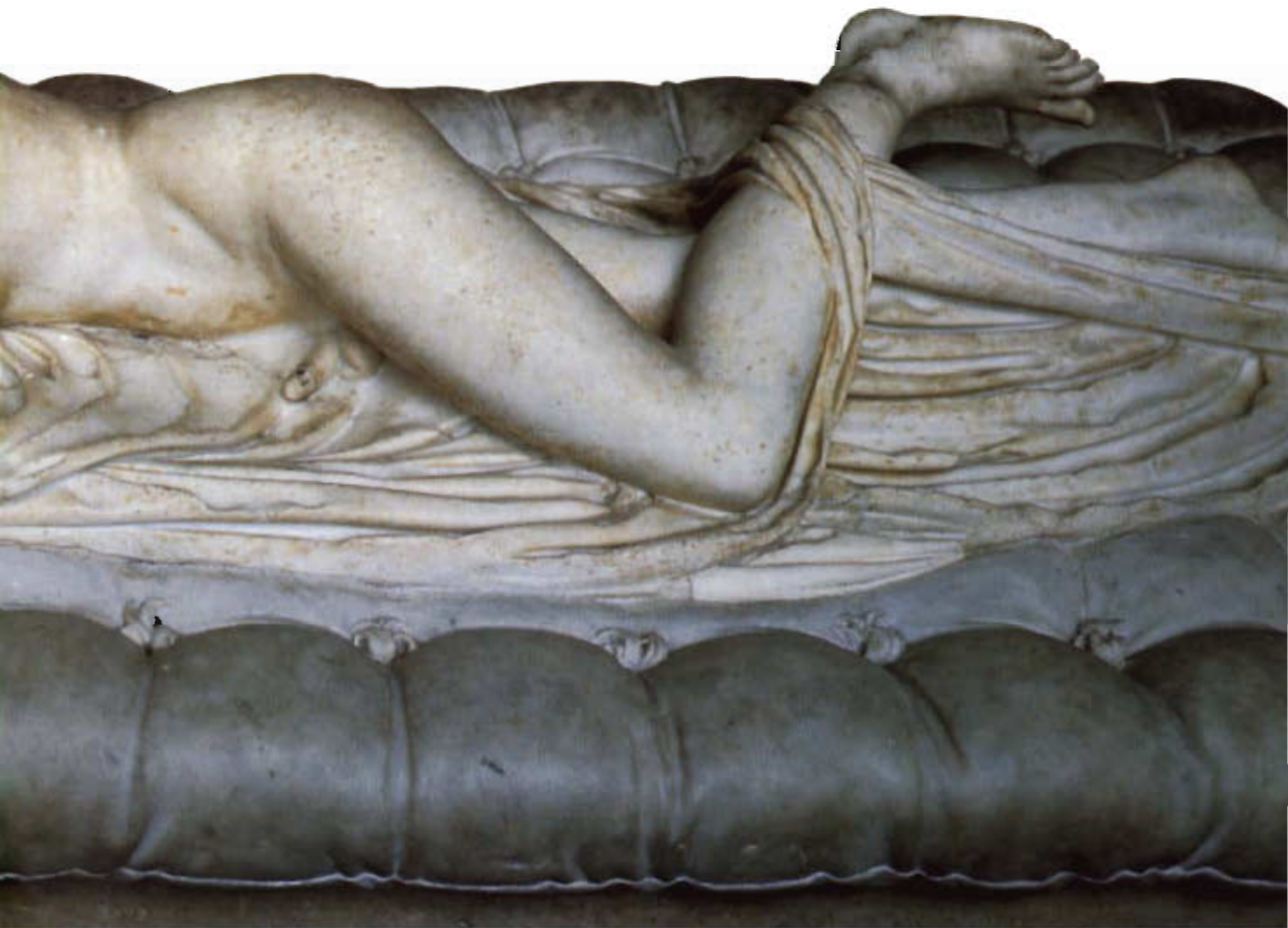
Sleeping Hermaphrodite, Roman, Second Century B.C.

In reality though, few such students would make it as