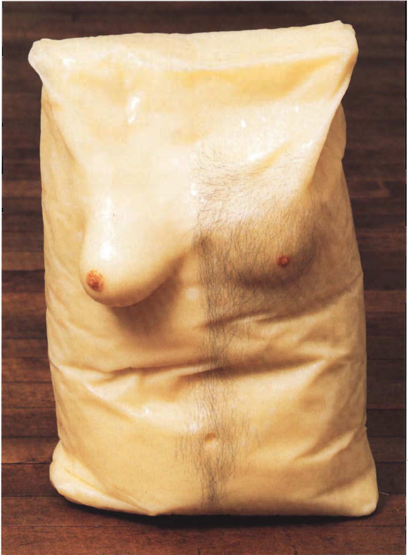
Robert Gober, Untitled, 1990